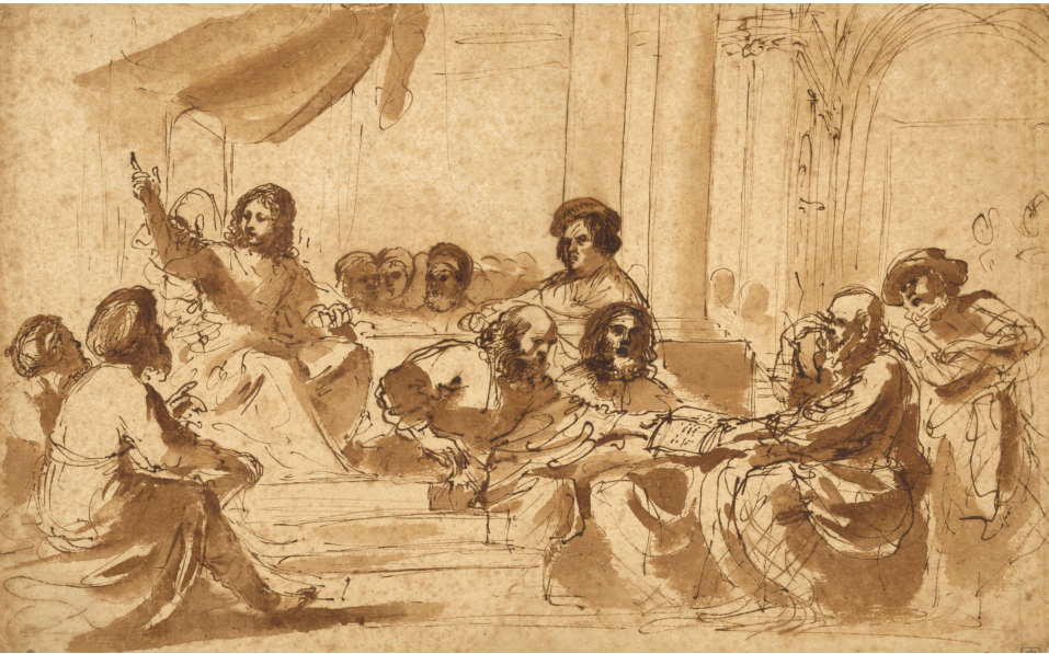
Guercino, 1591-1666. Christ Preaching in the Temple, from Art in the Christian Tradition, a project of the Vanderbilt Divinity Library, Nashville, TN