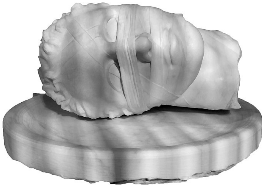
Mitoraj, Igor. Head of John the Baptist, from Art in the Christian Tradition, a project of the Vanderbilt Divinity Library, Nashville, TN.