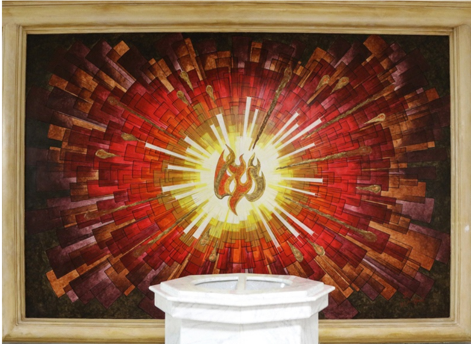
Holy Spirit and Fire with Baptismal Font, from Art in the Christian Tradition , a project of the Vanderbilt Divinity Library, Nashville, TN