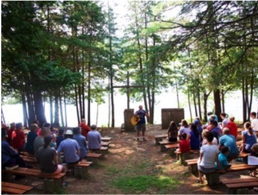
Outdoor Chapel at Gracefield Christian Camp and Retreat Centre