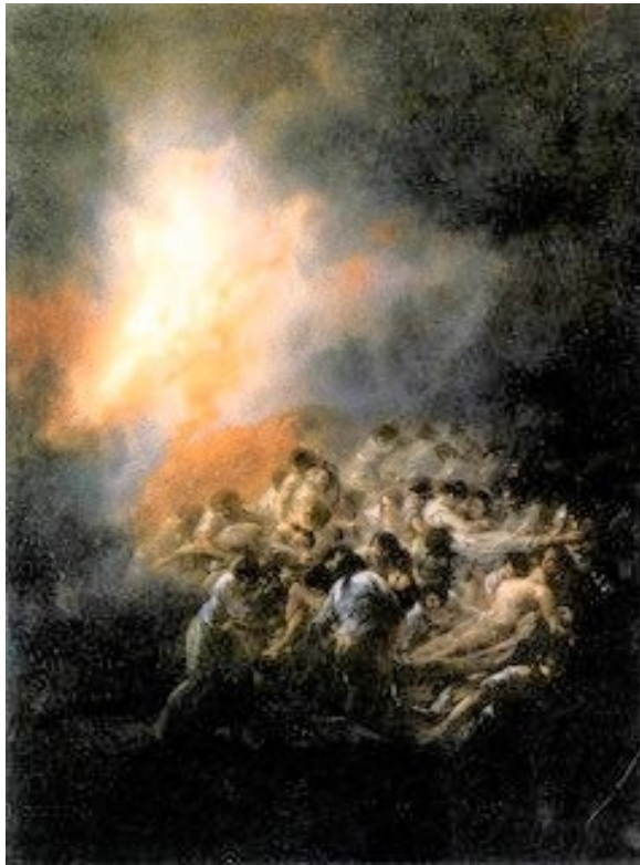
Incendio, fuego de noche (Fire at Night), by Francisco Goya, 1793. Art in the Christian Tradition, a project of the Vanderbilt Divinity Library, Nashville, TN