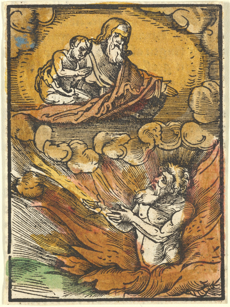
Rich Man in Hell and the Poor Lazarus in Abraham's Lap, by Hans Leonhard Schäufelein, 1517

St Giles Presbyterian Church seeks to be a welcoming, fully-alive faith community, which shares Christ's vision for the world and responds in a Christ-like manner to the present-day challenges of our society and world in partnership with all who seek to make Christ's vision for the world a present reality.