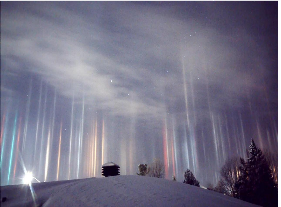
near North Bay, Ontario