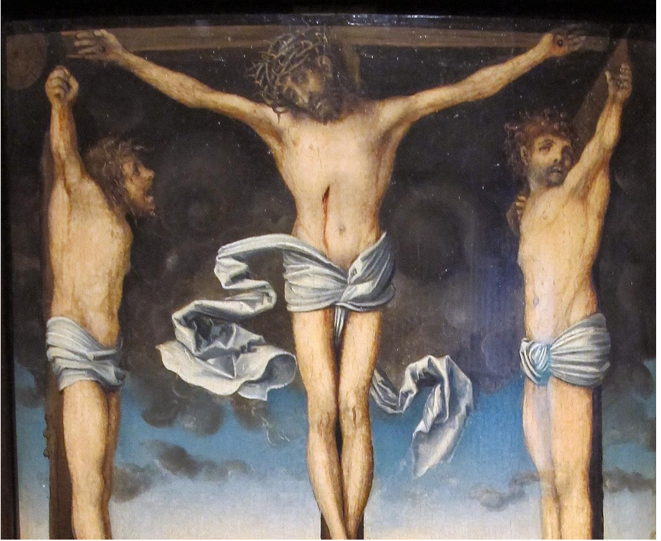
Cranach, Lucas, 1472-1553. Christ on the Cross Between the Two Thieves , from Art in the Christian Tradition , a project of the Vanderbilt Divinity Library, Nashville, TN.