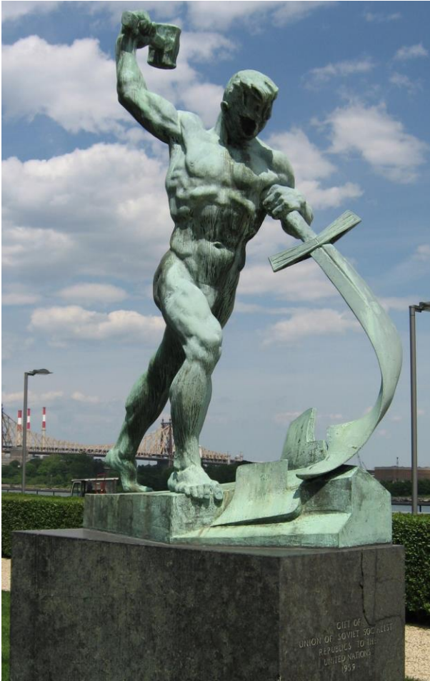
Bronze sculpture by Evgeniy Vuchetich, at the exterior ground of the United Nation.