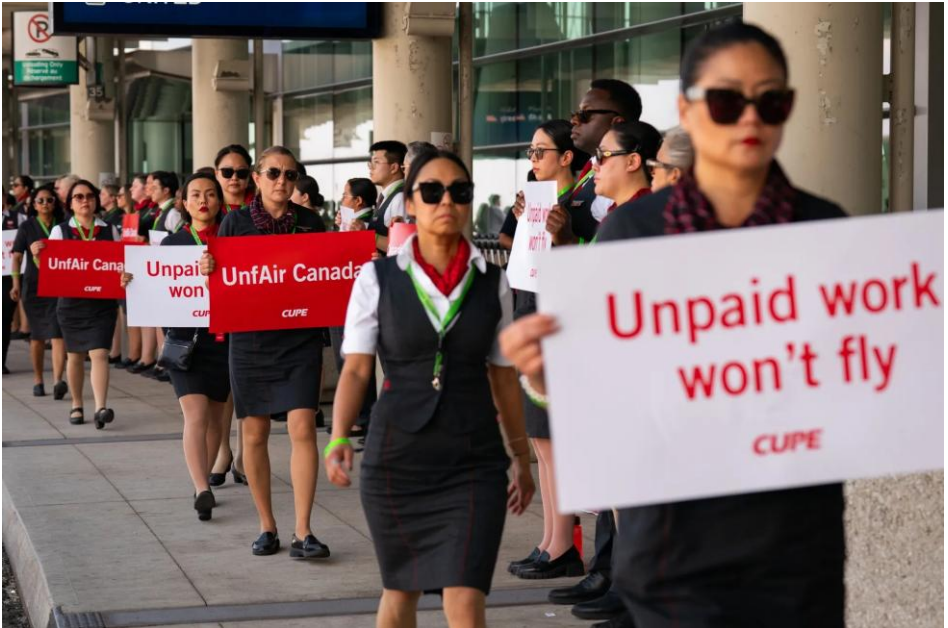
Air Canada flight attendants protesting against unpaid and unfair work, on August 13, 2025.